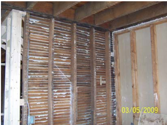
Eng Farm Renovations: These photos are of the main house. We have added new windows, insulation, and walls. Painting begins soon!