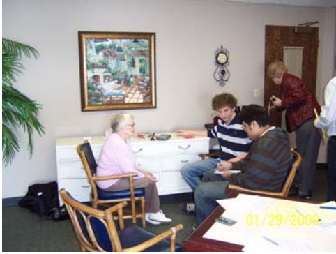
Oral History Project Left: History Students from the Kishwaukee Education Consortium interview Oak Crest residents for "Journey Stories." Right: Fourth graders interview local farmers for the upcoming "Memories from the Farm" exhibit.